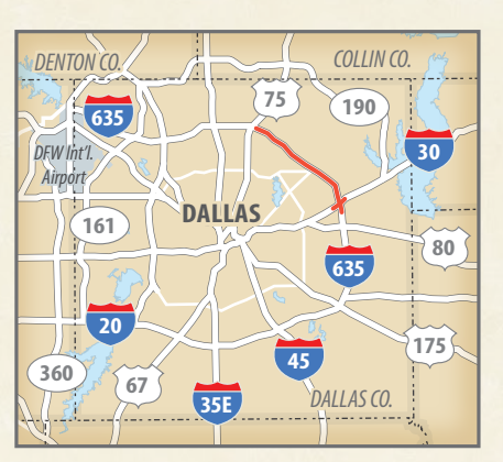
I-635 project limits.