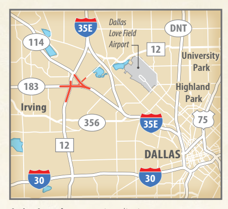
Irving Interchange project limits.