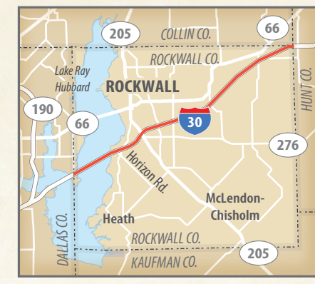
I-30 East project limits.