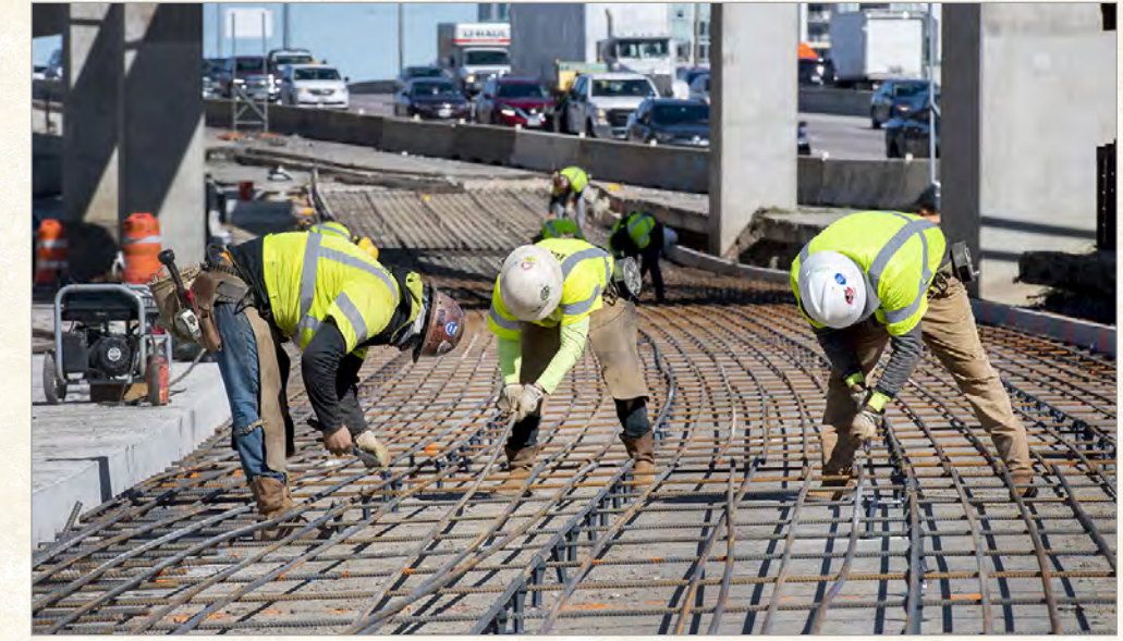
Lowest Stemmons progress: Paving work underway.