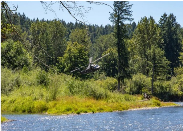
Low Level Flight Operations