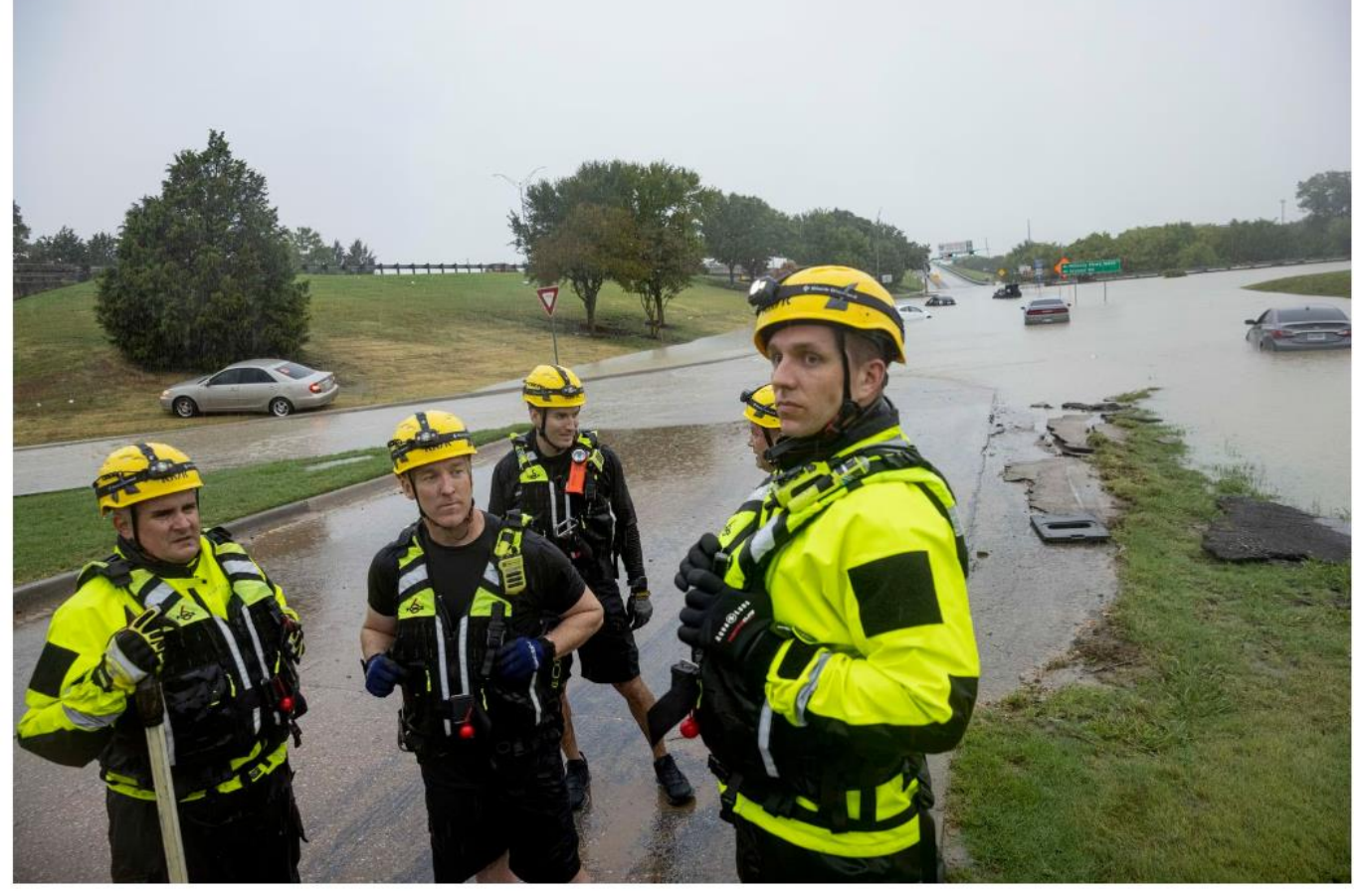
Members of the Mesquite Fire Department survey the flooded area of Interstate 635 Service Road on Monday, Aug. 22, 2022, in Mesquite,

Water rescues live on air Drone video was available Several TXDOT Cameras showed high water Launched a chopper for coverage Several images/ videos from viewers 12 hour+ shifts for several staff members