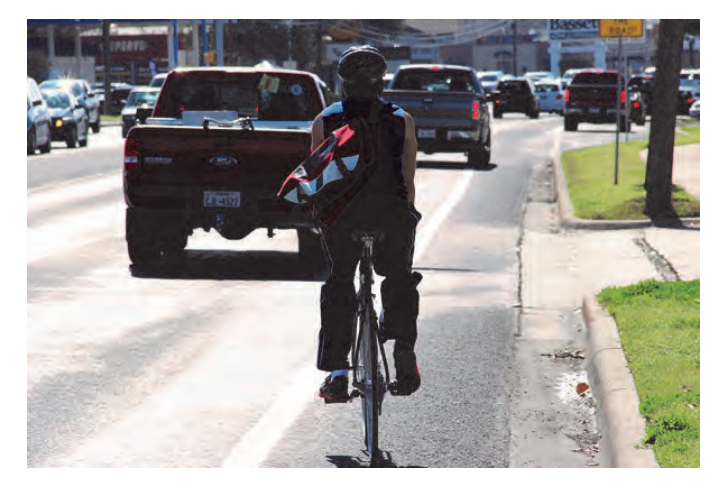
Drivers should allow plenty of distance when passing bicyclists