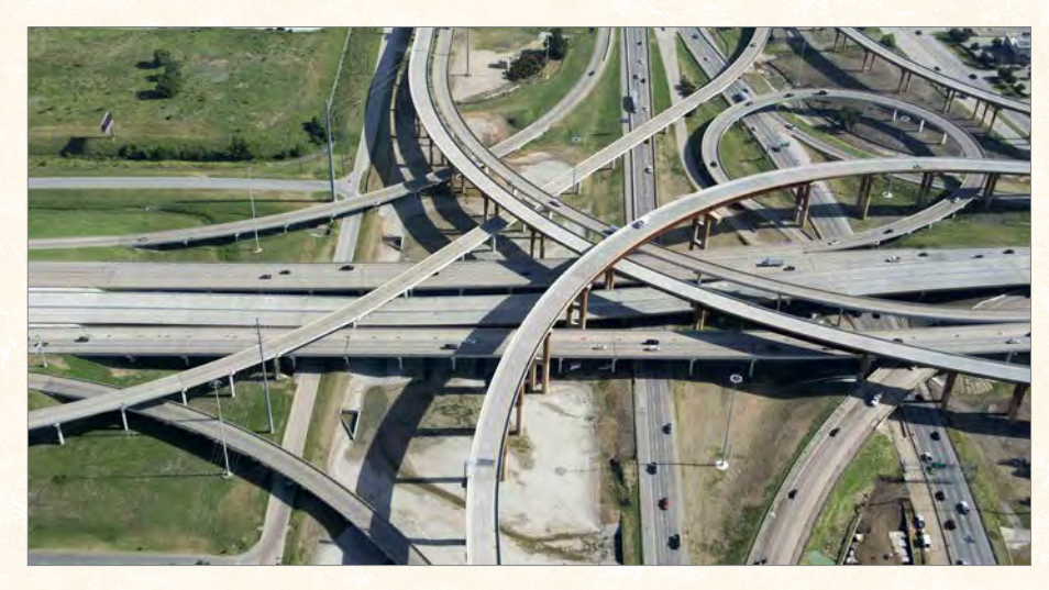
The Interstate 35E-LBJ Freeway interchange, part of the $3.1 billion LBJ Express project that is nearing completion.

The majority of the managed lanes were constructed sub-grade in a cantilevered, depressed corridor under the mainlanes. The project also includes elevated managed lane connections on I-35E that feed directly into the managed lanes on I-635. The project also includes bypass lanes at most of the major intersections along the corridor; new