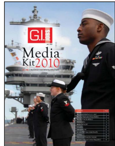
Internet advertising.

Military.com advertising and marketing programs connects with servicemembers, military families and veterans. The website is a resource for all the benefits of service — government benefits, scholarships, discounts, lifelong friends, mentors, great stories of military life or missions, and much more. However, a $20,000 minimum commitment is required to place advertising.