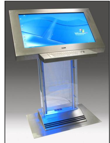
Airport Kiosk.

While not all events are held “outside,” sports venues such as the Dallas Cowboys and Texas Rangers offer possibilities for PSAs or “discounted” advertising rates to promote the region-wide initiative. In addition, kiosks at Dallas/Fort Worth International Airport (DFW) should be presented in a prominent space for marketing aviation education.