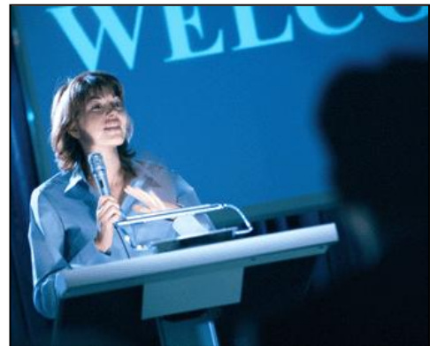
A speakers bureau.