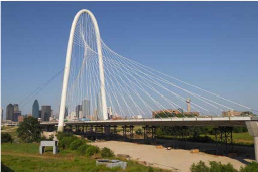
Margaret Hunt Hill Bridge in Dallas

In nonattainment areas, single occupant vehicle (SOV) capacity improvements must be included in a congestion management system. In addition, the resulting SOV projects must utilize management strategies such as travel demand reduction and operational management strategies as appropriate for the corridor. Projects that have advanced beyond the National Environmental Policy Act (NEPA) stage prior to April 6, 1992, and which are actively advancing to implementation, are not subject to this provision. Additional information on the CMP is provided in Appendix E.