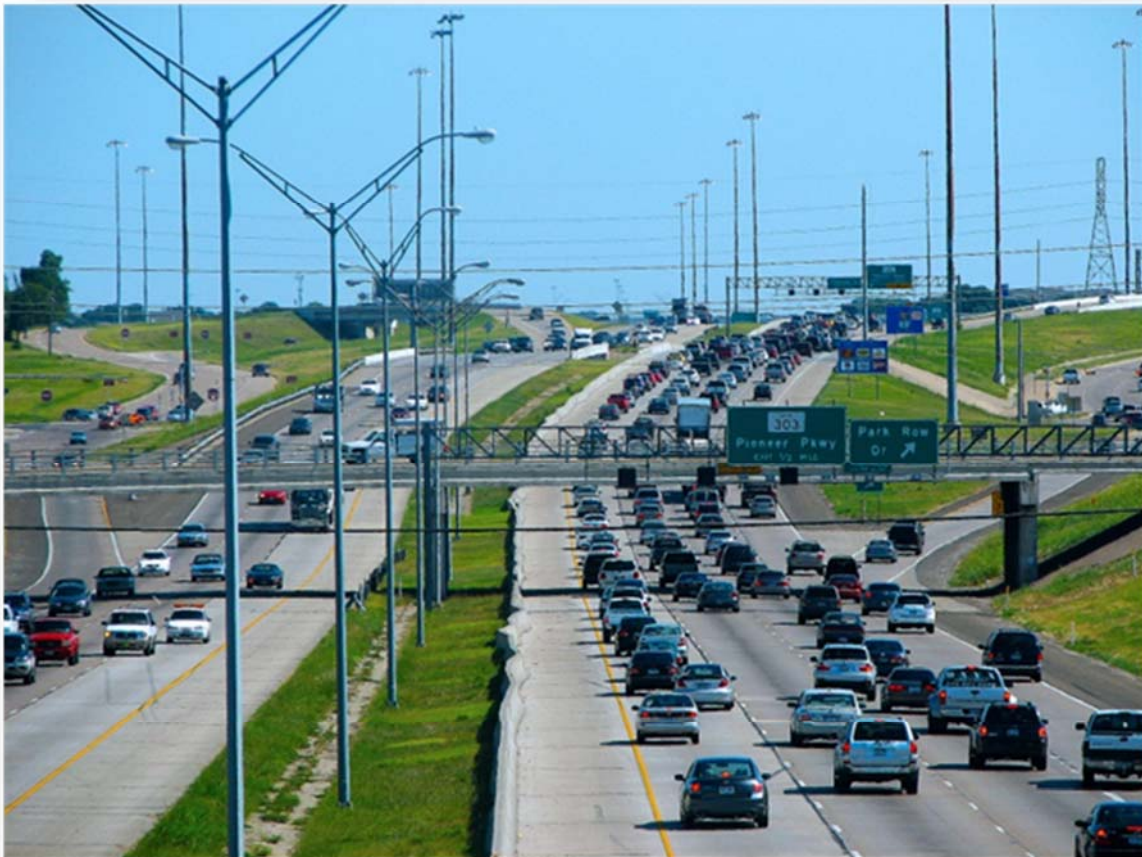
SH 360, Arlington

and public transportation authorities. Specific requirements of the TIP and a brief discussion of how NCTCOG complied with these requirements are outlined next.