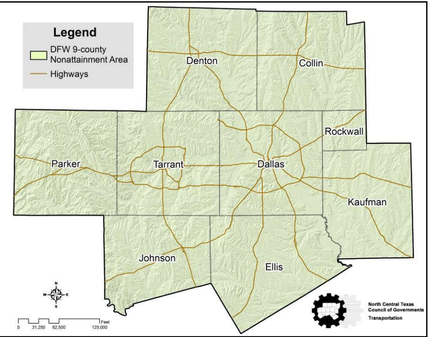
MAP 1: DFW OZONE NONATTAINMENT AREA

A calculator is available online at www.nctcog.org/dirp to help evaluate cost per ton for specific projects based upon each applicant's specific activity levels.