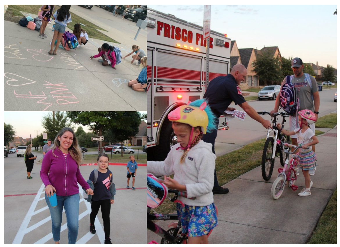
Pink Elementary: Top Left; Bledsoe Elementary: Bottom Left, Right