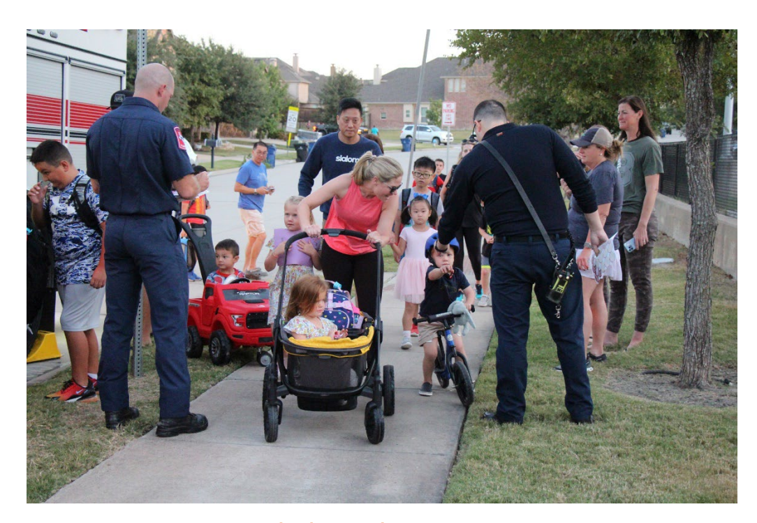
Bledsoe Elementary