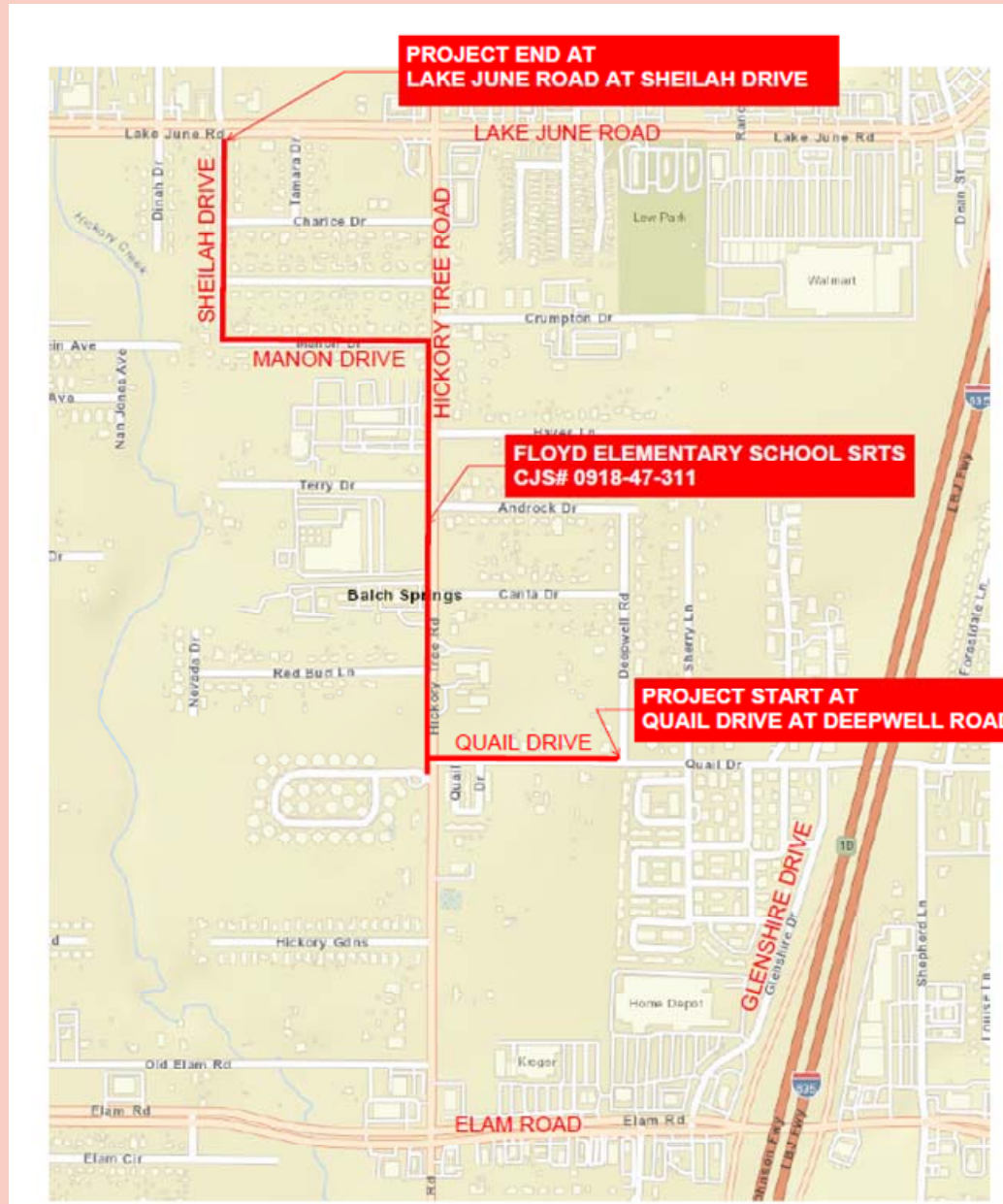
Example Project Location Map 1