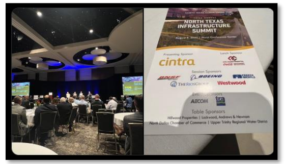
Where?? — herb(@foster_irby) What's the location? — herb(@foster_irby)

@NTxCommission — TEXpress Lanes (@TEXpresslanes)