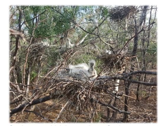
Cattle egret chick in a rookery. Cattle egrets are typically the last to arrive at rookeries.

Colonial-nesting waterbirds are protected by both federal and state laws (Migratory Bird Treaty Act, and Texas Parks and Wildlife Code Chapter 64, respectively). Harassment techniques can be used to encourage the adult birds to relocate before eggs are laid, provided that no birds are injured or killed. Once the first egg has been laid in any nest in the rookery, the law severely limits what can be done to deter the birds. Typical daily activities such as mowing, garbage collection, and pressure spraying sidewalks can continue as planned. However, any actions intended to disturb the birds or actions that would present a disturbance must stop. The most effective tool in rookery management is preventing the colony from becoming established.