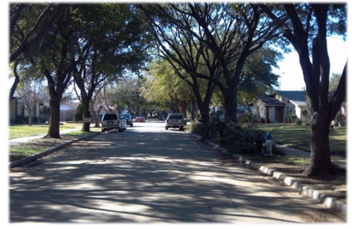
The trees on the left side are untrimmed while the trees on the right have been trimmed to reduce canopy cover, which deters egrets from nesting.