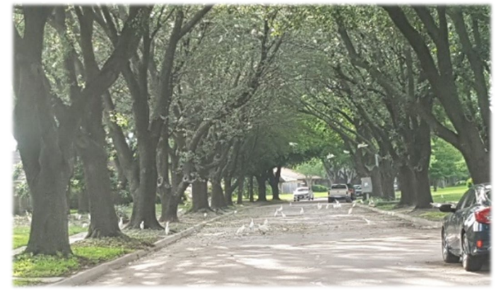
A rookery established in a suburban neighborhood. The street and sidewalks are covered in bird droppings. Prevention of rookery establishment is the best approach.