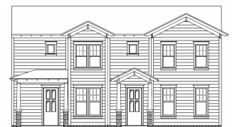
Single-Family Attached Prototypes for the T3-T Zone