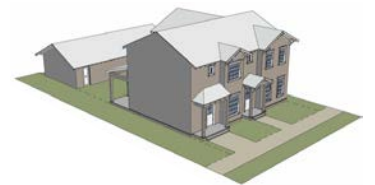
Typical Massing of a Building in the T3-T Zone