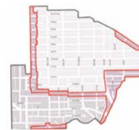
T3-T Transition Zone