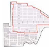
T3-H Historic Neighborhood Zone

These guidelines were used in discussions that led to changing zoning regulations in and around the Evans & Rosedale Urban Village to a form-based code.