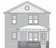
Single-Family Detached Prototypes for the T3-H Zone