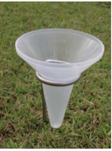
Commercial catch can with stand.

For irrigation scheduling purposes, the most accurate determination of precipitation rate is achieved by conducting a "catch can" test. Catch can tests measure the amount of water that actually hits the ground at various points within the landscape, and also serves to measure application uniformity. Since irrigation systems commonly use different types and brands of sprinklers, it is important to conduct catch can tests for each individual zone or "station" on an irrigation system.