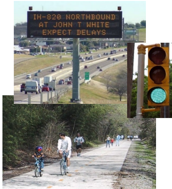
Exhibit 3.1-1: Intelligent Transportation System Message Sign/Traffic Signal/Bike Pedestrian Path

Federal law also requires the state, working with the nonattainment area, to develop additional control measures to meet the Reasonable Further Progress (RFP) and Attainment Demonstration (AD) SIPs. Examples of these programs are included in Chapter 4 in the AD and RFP SIP. In addition, Appendix H of the AD SIP includes locally implemented control strategies adopted by the RTC. 15