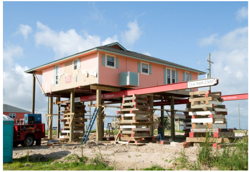
Crystal Beach, TX

TWDB Flood Outreach Program NCTCOG Floodplain Seminar Arlington November 2024