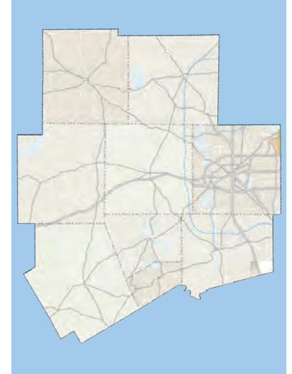
Tarrant . Johnson Parker . Wise . Hood Erath . Palo Pinto Jack . Somervell