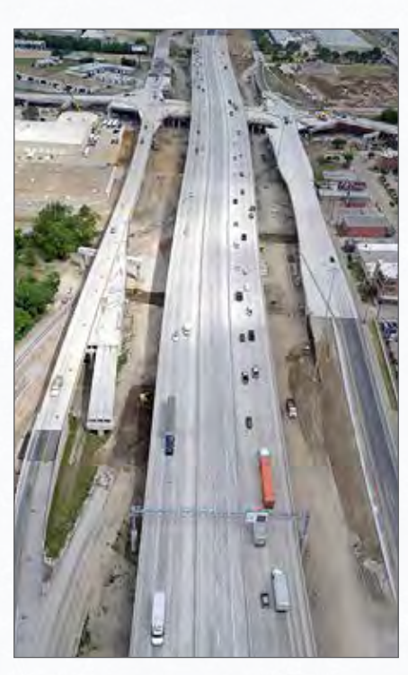
Above image: Belt Line Road interchange in Carrollton.

This major corridor of I-35E serves the rapidly growing areas of southern and central Denton County, as well as the major Dallas suburbs immediately north of I-635. This corridor functions as a major artery for hundreds of thousands of commuters, as well as a primary link to major universities in the city of Denton, including the fourth-largest university in the state, the University of North Texas (UNT). In addition, I-35E is an important truck corridor