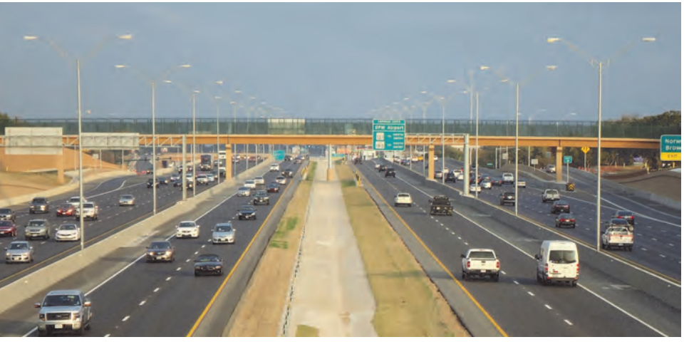
In 2014, the 13-mile North Tarrant Express opened nine months ahead of schedule. The $2.5 billion project rebuilt the infrastructure and added TEXpress Lanes along I-820 and SH 121/183 from I-35W in Fort Worth to FM 157.