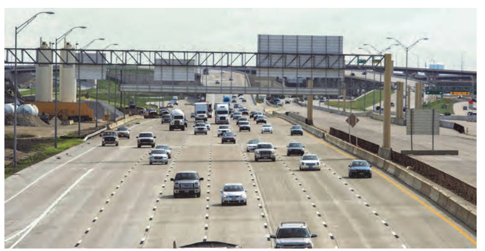
When the $1 billion DFW Connector was completed in 2013, it doubled the size of the existing highway system along the SH 114 and SH 121 corridor in Grapevine.