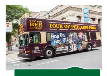
Inner-City Tour Bus