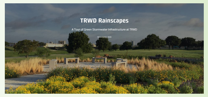
TRWD Rainscapes Story Map