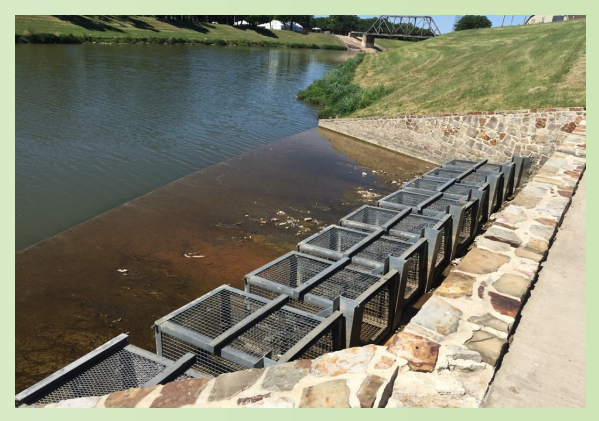
TRWD Trash Baskets