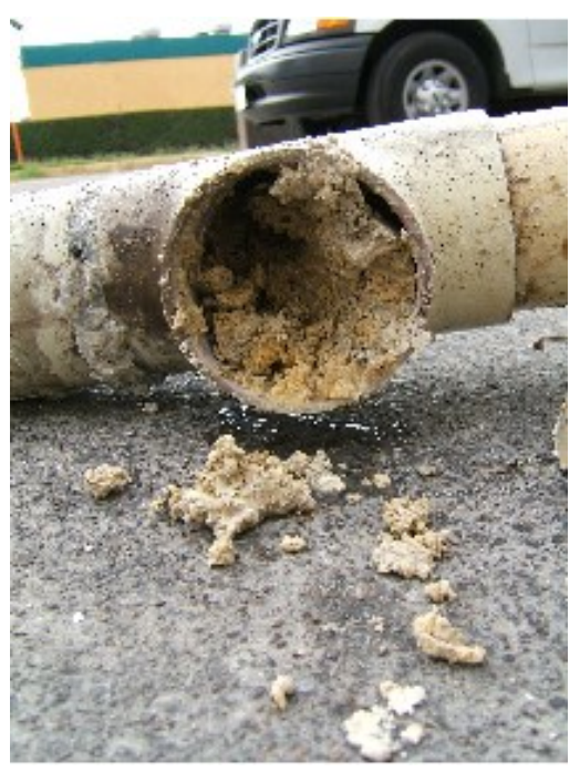
Pipe clogged with solidified grease buildup

Fats, oils, and grease (FOG) are considered to be the leading cause of blockages in sanitary sewers, and the EPA estimates that blockages account for nearly 50 percent of all Sanitary Sewer Overflows (SSOs) (US EPA,