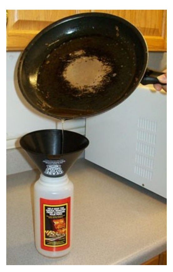
Proper disposal oil spent oil using a funnel and disposable bottle

Fats, oils, and grease (FOG) are considered to be the leading cause of blockages in sanitary sewers, and the EPA estimates that blockages account for nearly 50 percent of all Sanitary Sewer Overflows (SSOs) (US EPA,