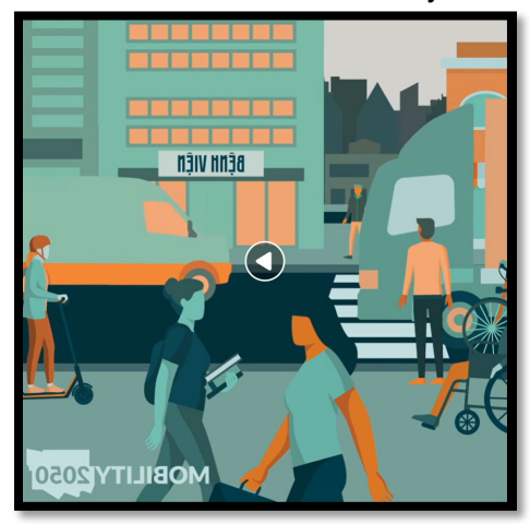
0/10 ፟ — Quay Hai

1. Hệ thống giao thông Dallas-Fort Worth đáp ứng nhu cầu của bạn tốt đến mức nào? #ConnectNorthTexas #Mobility2050 — NCTCOG Transportation Department