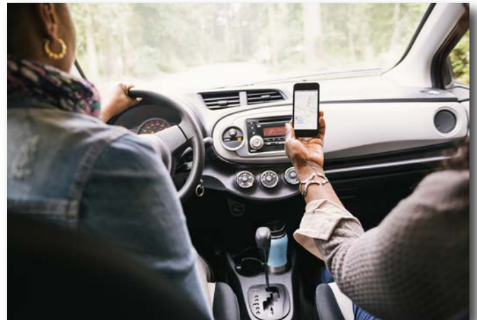
The updated 511DFW Traveler Information System is a resource drivers can use to help them get around the region efficiently.

511DFW is continually being refined based on public feedback. We can't wait to hear your input!