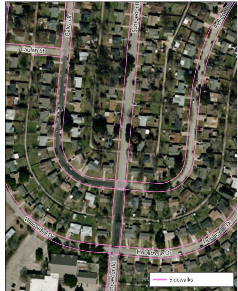
Figure 1: 2025 6-inch Aerial Imagery with Sidewalks (pink)

Staff focused on digitizing sidewalks that served public right-of-way. This included facilities such as trails that also serve as off-street bikeways. Private sidewalks around areas such as shopping centers or apartment complexes were not included, unless that sidewalk is also serving a public connection. Special attention was paid to gates or other barriers that restrict walkways that may otherwise appear public.