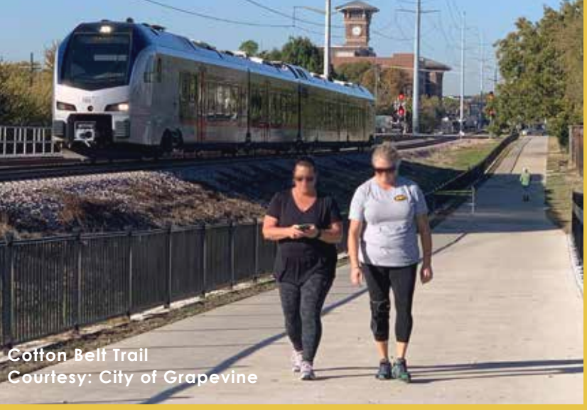
Cotton Belt Trail