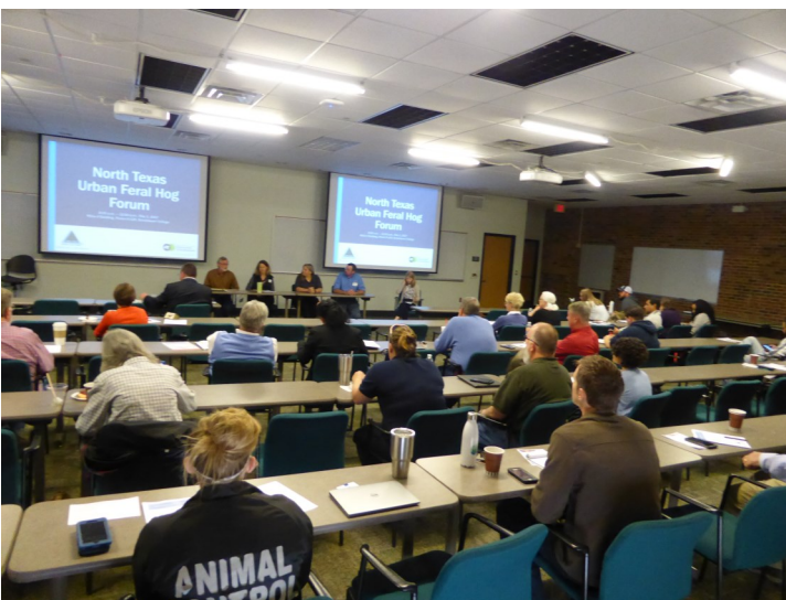
Local government roundtable discussion at the North Texas Urban Feral Hog Forum