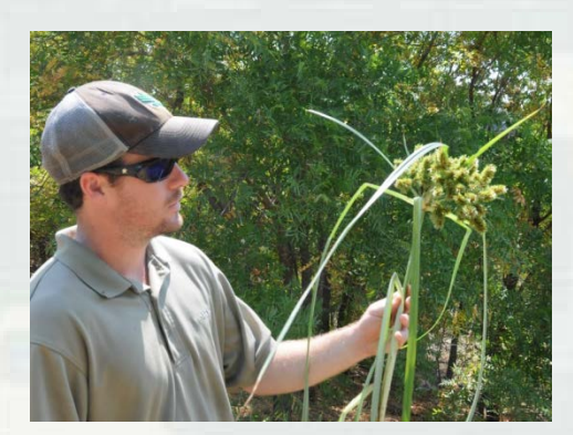
Lake Lewisville-Frisco Section 1135 Environmental Restoration