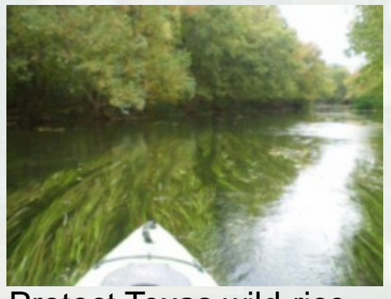
Protect Texas wild-rice

San Marcos Section 206 Aquatic Ecosystem Restoration