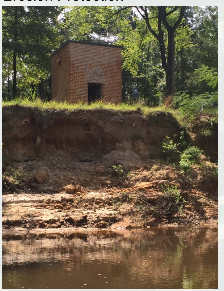
Haltom City Section 205, Local Flood Damage Reduction