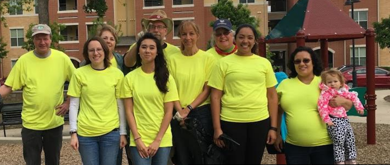
Richardson Trash Bash April 16, 2016