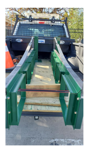
Transport in Bed of Truck